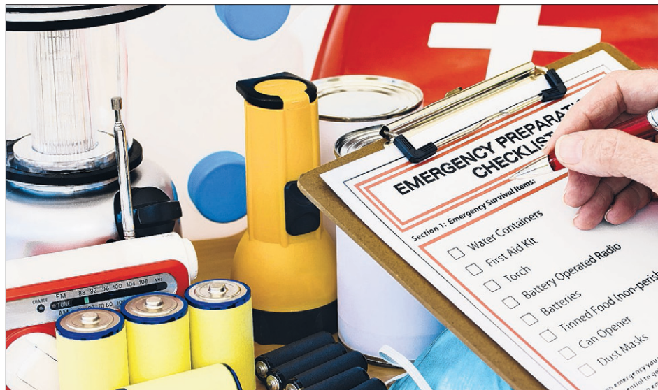
An emergency checklist is a must during hurricane season.

■ Photograph any damage immediately and email to insurance company. If cellular lines are operating, use mobile phone